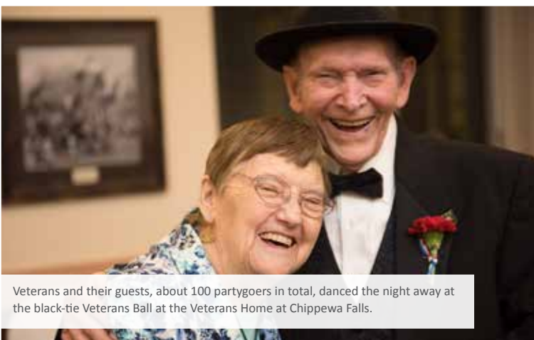
Veterans and their guests, about 100 partygoers in total, danced the night away at the black-tie Veterans Ball at the Veterans Home at Chippewa Falls.