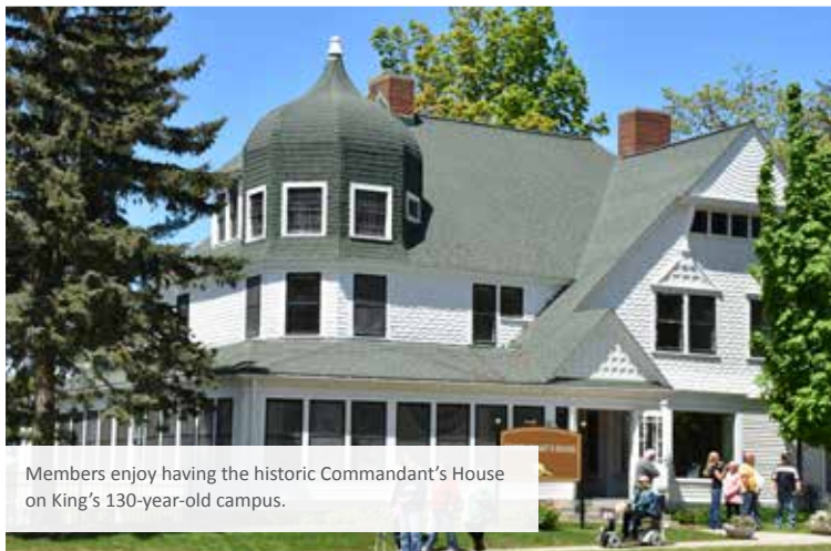
Members enjoy having the historic Commandant's House on King's 130-year-old campus.