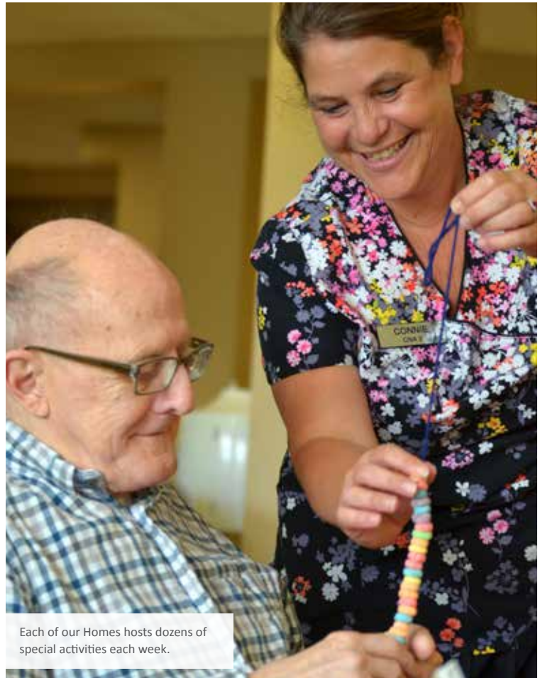
Each of our Homes hosts dozens of special activities each week.