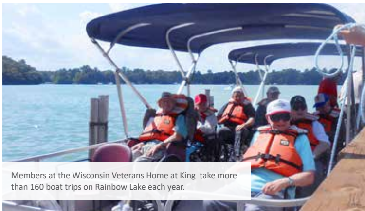
Members at the Wisconsin Veterans Home at King take more than 160 boat trips on Rainbow Lake each year.

The Wisconsin Veterans Homes provide 5-star medical care to our members, the highest rating possible as determined by the Centers for Medicare and Medicaid Services. Skilled nursing facilities with 5-star ratings are considered to provide excellent care. We are also proud of our beautiful campuses – from our scenic campus right on Rainbow Lake, to our cozy countryside home just minutes from downtown Milwaukee, to our Northwoods facility in Chippewa Falls.