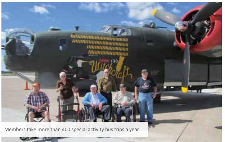
Members take more than 400 special activity bus trips a year.