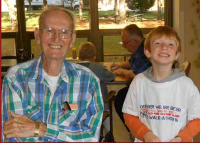
Students from the Waupaca Learning Center came to visit.