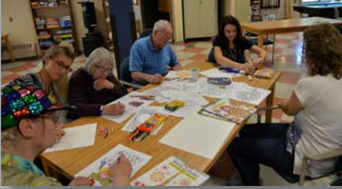
Members at Ainsworth Hall enjoyed creating beautiful art pieces.