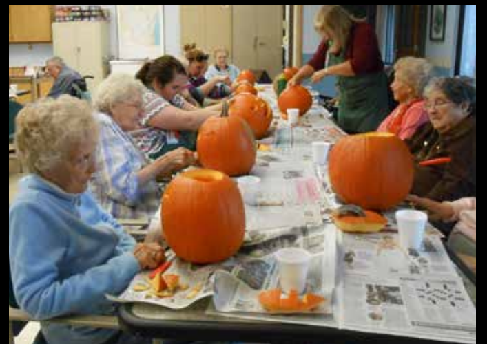
Carving pumpkins for decorations!