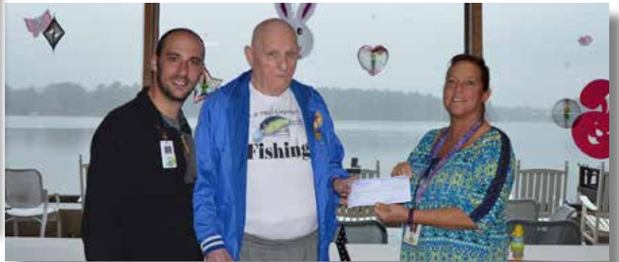
The American Legion Auxiliary Post 161 donated $6734 to the Ainsworth Hall Special Care Units.